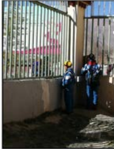
▶ Images taken from Guo Tingting's 2018 thesis, "A Study on the Emotional Needs of Rural Boarding School Pupils in Tibet"