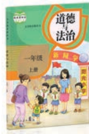
“Morality and the Rule of Law,” 1st grade textbook, 2016 ed., People’s Education Press.