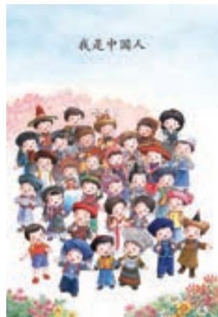
Lesson 1 “I am Chinese,” taken from the 1st grade textbook “Language,” 2016 ed., People’s Education Press.