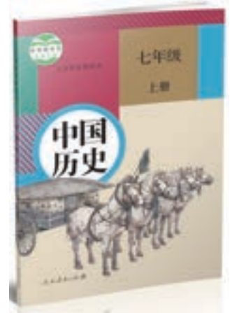
“Chinese History,” 7th grade textbook, 2016 ed., People’s Education Press.