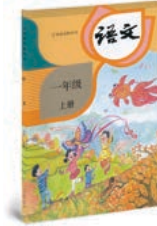
“Language” [i.e., Chinese], 1st grade textbook, 2016 ed., People’s Education Press.