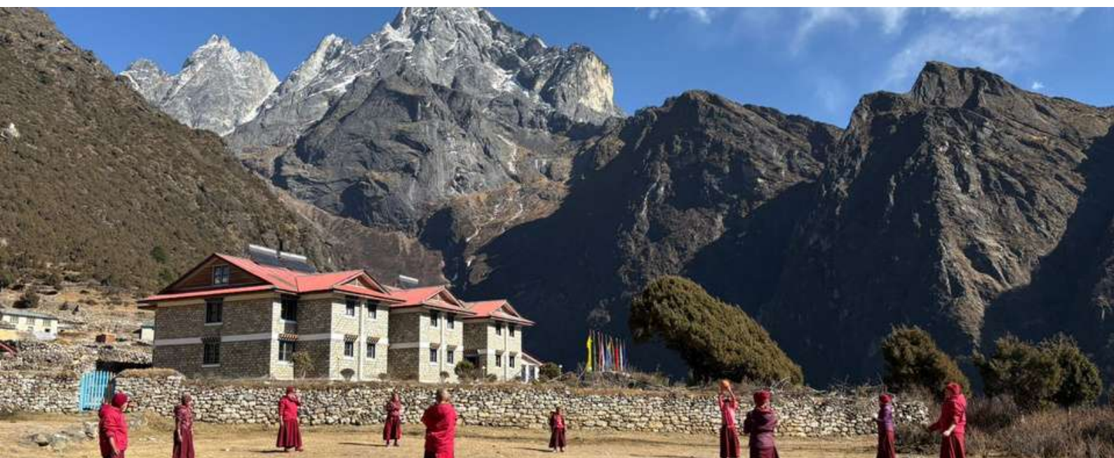
A place called Mending above nunnery