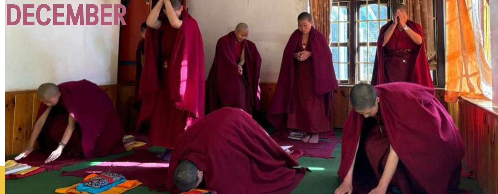
Annual memorization exams